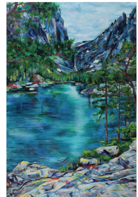
Rebekah Chauvin Rocky Mountains Emerald Lake